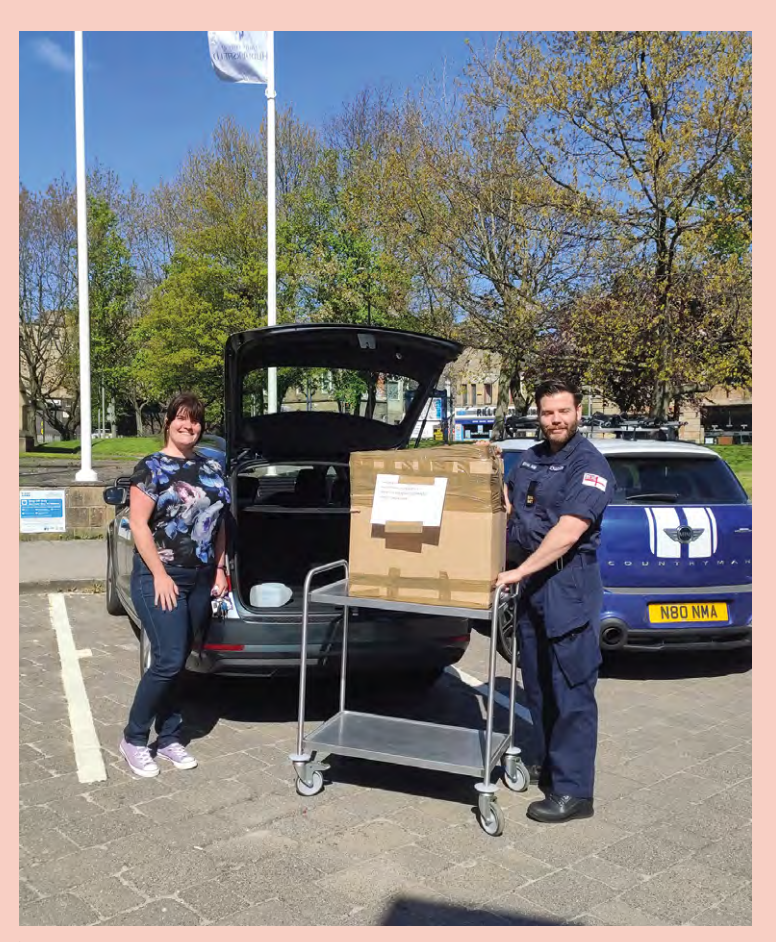
University loans DNA sampler to the Government for COVID-19 testing

Huddersfield scientists responded to a request from 10 Downing Street for high-tech equipment in the Government's efforts to increase the testing of the public for coronavirus.